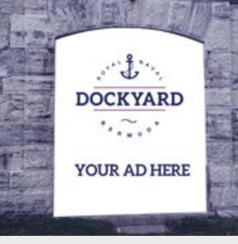
Arch Signs varies depending on location