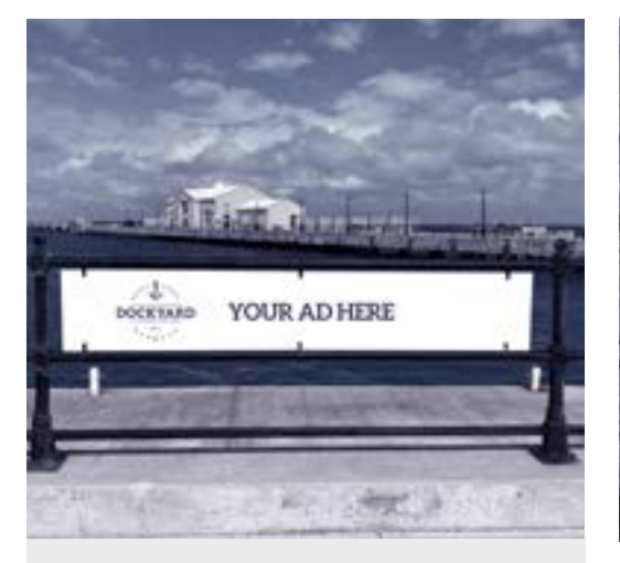
Rail Signs 90"w x 15"h